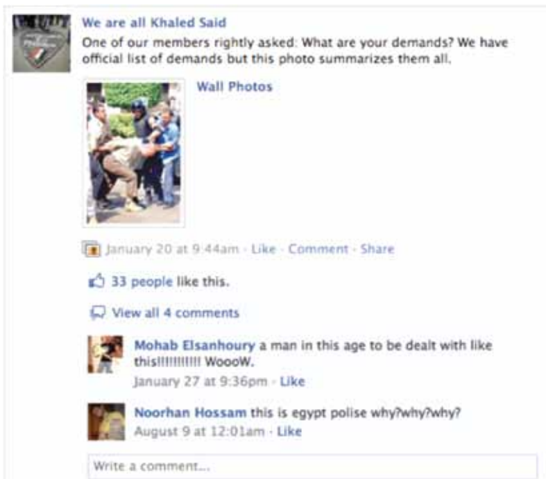
Figure 4: Snapshot of WAAKS English, 20 January 2011

media played a significant role. The call to arms unleashed an outpouring of emotion and solidarity with the community: responding to Ghonim's post on 18 January, Mohamed Issa wrote 'January 25th is the beginning, the days that follow will force the tyrant [Mubarak] to leave' (WAAKS Arabic, 2011). There are thousands of examples of similar sentiments; one such is shown in Figure 4.