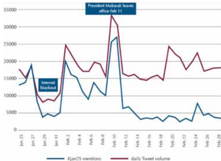
Figure 3: Daily Tweet volume and mentions of #jan25 in Egypt