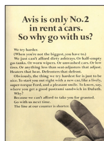
Figure 2: Being different, trying harder– Avis print ad. (DDB 1962).

You know most people don't understand the difference between 'market growth' and 'market share.' Market growth only the brand leader can do, vs. market share is what you have to do if you are not the brand leader, by taking share from the brand leader. You need to have a message that says I'm not the leader. Like when Bill Bernbach of DDB did with the American car rental company Avis, who were 'number 2.' against the market leader Hertz. If you ever want to teach anybody a case history it is the Avis against Hertz campaign. The main message was 'Avis is only No.2 in rent a cars. So why go with us? We try harder!' ( Figure 2 ). Now Avis can't say that any more as they're both number one in the USA.